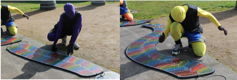
Foam Construction - human form focus.