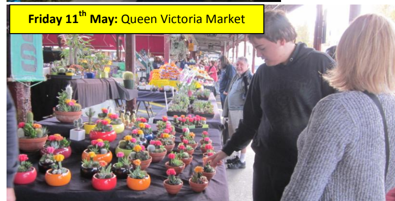
Friday 11 th May: Queen Victoria Market

Thursday 10 th May: The zoo was good because it was interesting seeing all the different animals. We went to Melbourne Aquarium and I saw penguins. They looked like little men in suits.