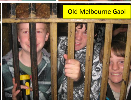
Old Melbourne Gaol

Thursday 10 th May: The zoo was good because it was interesting seeing all the different animals. We went to Melbourne Aquarium and I saw penguins. They looked like little men in suits.