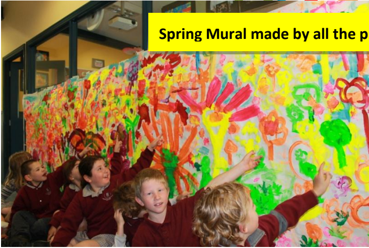
Spring Mural made by all the primaries and select senior students