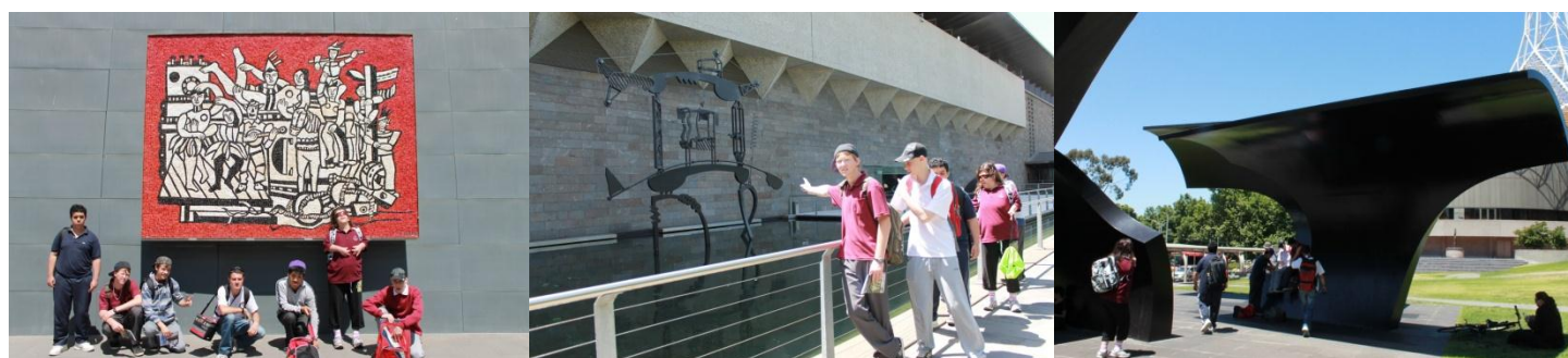
A mosaic display and Inge King – The Wave