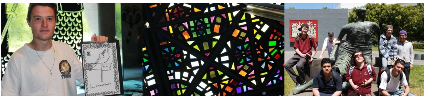
Leonard French – Coloured glass ceiling and bronze sculpture.