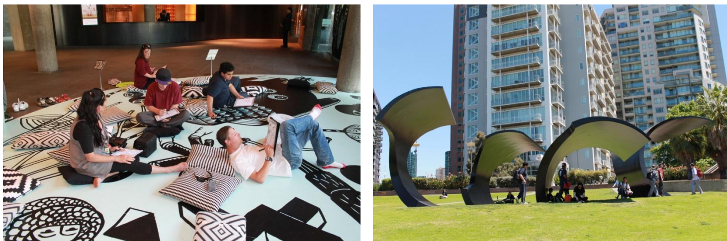
Interactive sculptural installation and the Wave