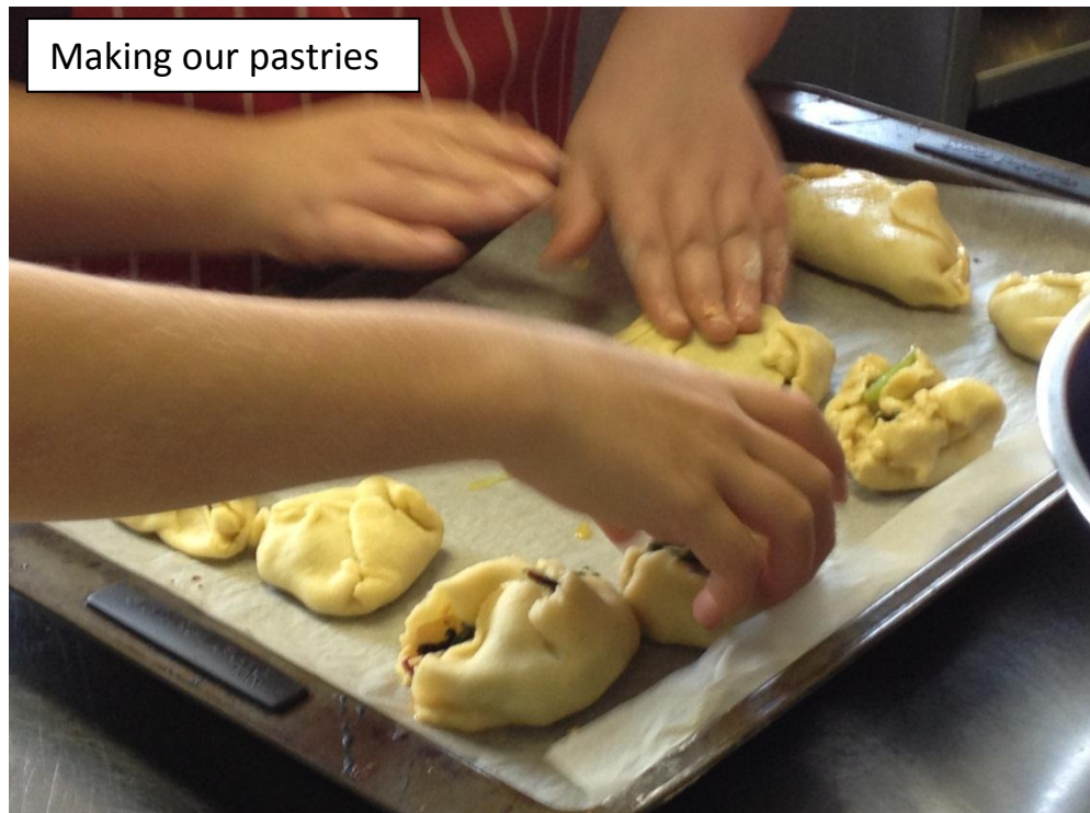
Making our pastries

Next Tuesday we will eat our pastries for morning tea and celebrate our kitchen garden bounty!