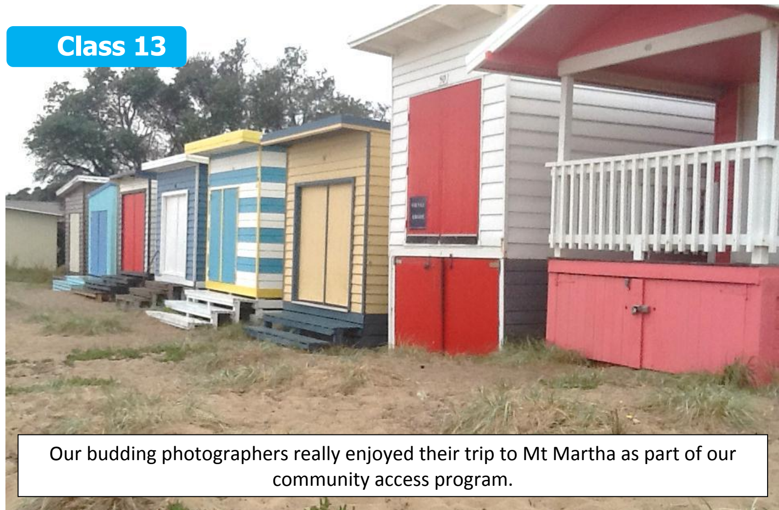
Our budding photographers really enjoyed their trip to Mt Martha as part of our community access program.