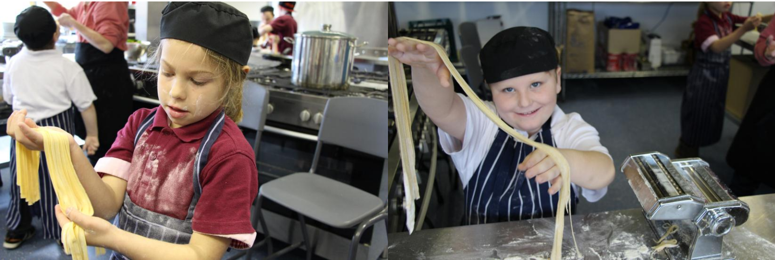
Mama Mia! Pasta Class.