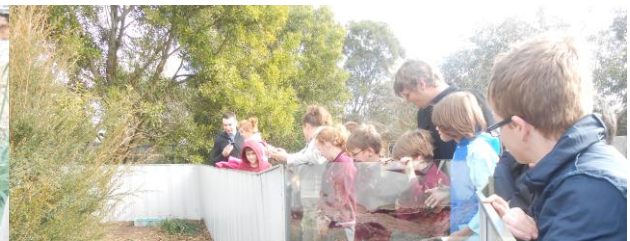
I really enjoyed feeding the wallabies. You had to be very quiet to get near them.